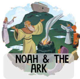
NOAH & THE ARK