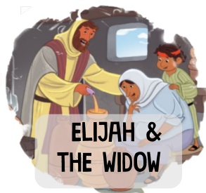
ELIJAH & THE WIDOW