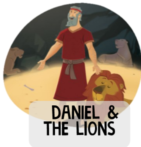
DANIEL & THE LIONS