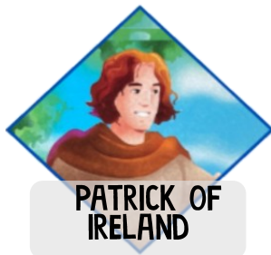
PATRICK OF IRELAND