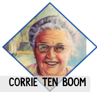
CORRIE TEN BOOM