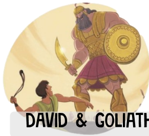
DAVID & GOLIATH