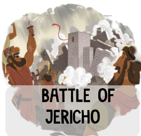
BATTLE OF JERICO