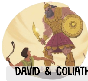
DAVID & GOLIATH