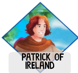
PATRICK OF IRELAND