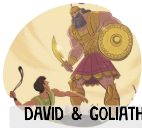
DAVID & GOLIATH