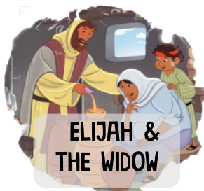
ELIJAH & THE WIDOW