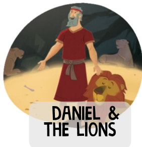
DANIEL & THE LIONS