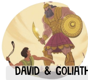
DAVID & GOLIATH