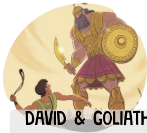
DAVID & GOLIATH