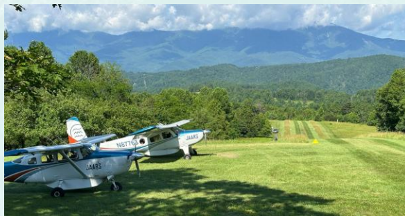
View from the top of Strawberry Ridge