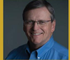
BISHOP TOMMY MCGHEE DISCIPLESHIP MINISTRIES