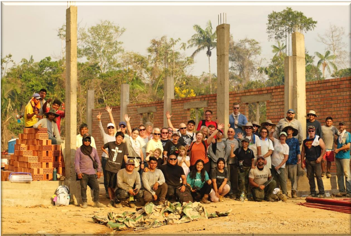
The Peru Team