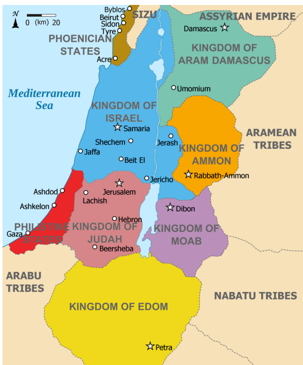
Map from Kingdoms_around_Israel_830_map.svg: *Kingdoms_of_Israel_and_Judah_map_830.svg: Richardprins (GNU FDL)

The ministry of Isaiah was filled with willingness and obedience. From confronting kings or telling of the coming Messiah. However, reading the book of Isaiah is often confusing. Here are some resources to understand it better.