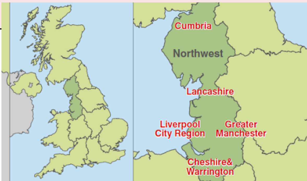
MAP OF NORTHWEST ENGLAND

We were delighted to take part in Culture Bridges—a program designed to help new arrivals in the UK engage effectively in outreach. We enjoyed the experience so much, and connected so well with the team, that we've been invited to become facilitators. We'll now help others adjust to UK culture and discover "bridges" for sharing the gospel.