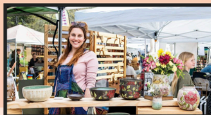
Artisan + Craft Market Over 30+ Local Vendors