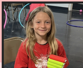
Kids Activities + Crafts in Lower Level

Free Admission to Community Day Tickets Required to Chili Cook-Off