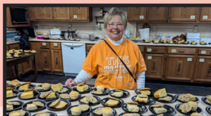
Baked Goods Sale Benefitting Local Youth Programs