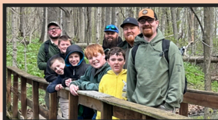
Boy Scout Troop 301 Flag Retirements + Demonstrations