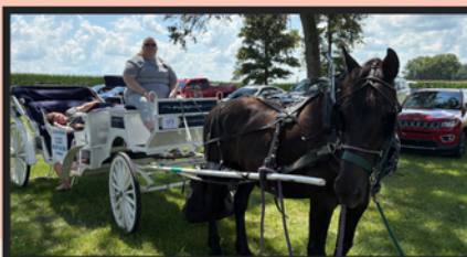
Carriage Rides Throughout the Day