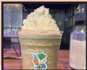
Luna Coffee Bar Fall Flights