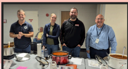
3rd Annual Chili Cook-Off Feat. Community Friends + Leaders