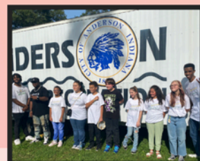
Young Maestros Live Performance