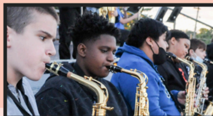
Anderson Prep Academy Live Performance