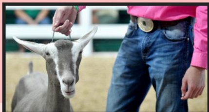
Madison County 4-H Live Animals