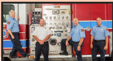
Anderson Fire Department Touch-A-Truck + Meet-and-Greet