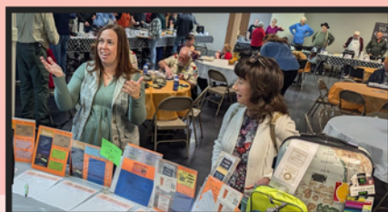
Huge Silent Auction To Get a Headstart on Christmas