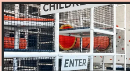
5 Story Indoor Playzone for children ages 2-12