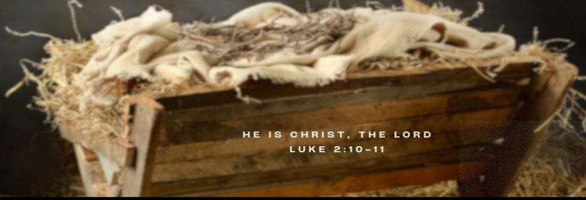
HE IS CHRIST, THE LORD LUKE 2:10-11